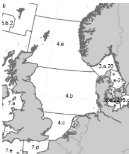
Figure 2. ICES Areas in and around the North Sea

Table 2 gives quota shares for Norway and the EU for the six jointly managed shared stocks in the North Sea. Although in principle the sharing is ad hoc from year to year, in reality the quota shares are fixed. As noted, Norway and the EU will every year agree on a TAC for the different stocks. Once TACs are set, national quotas follow from that. Although TACs will vary from year to year, 2020 TACs are also given in Table 2 so as to illustrate the importance of the various stocks. In terms of quantity, North Sea herring is by far most important, followed by plaice, saithe, cod, haddock and whiting. For Norway, herring and saithe are most important.