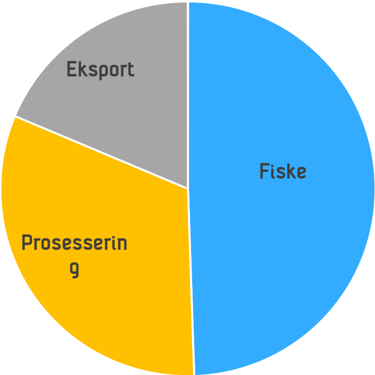
Carbon footprint fished products