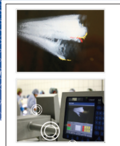
A terminal at a fish processing line, showing a fish fillet X-ray image for quality inspection

The objective of this project is to develop and test equipment to automatically cut the pinbones out of whitefish fillets, such as cod.