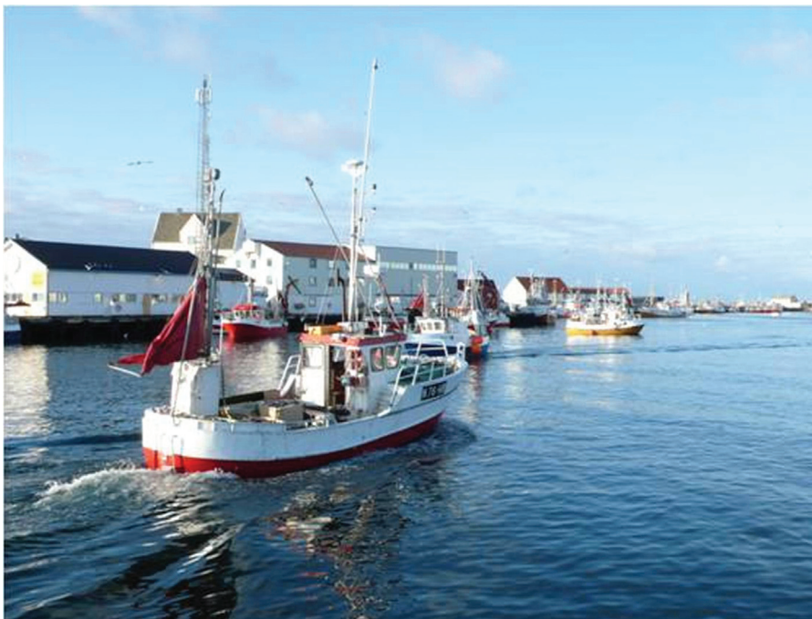
Implementation of traceability at the line level is challenging for wild-caught fish as there is less control over quantity of fish landed, variation in quality etc.

Communicating and understanding the benefits of a traceability system is important for successful implementation of traceability. If a company cannot identify any benefits in carrying out an implementation, the motivation will soon wane. This will affect the willingness to invest in any technology needed to achieve better documentation of products. Take, for instance, the following scenario: a production plant distributes its fish to a wholesaler who, in turn, distributes the fish to a supermarket. The supermarket is extremely keen to offer its customers more detailed information about the